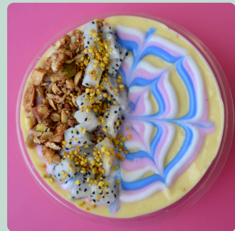
Grab-and-Go Bright Bowls