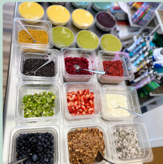
Build-Your-Own Bright Bowl Bar